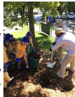
Bushlink visited our school recently. For more details, see Page 3.