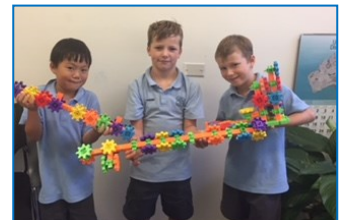
Year 2 students enjoying new resources