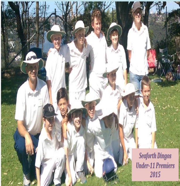
Seaforth Dingos Under-11 Premiers 2015