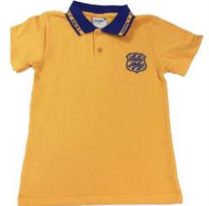
Gold Sports Short Sleeve Sports Polo