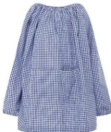
Art Smock (Optional)