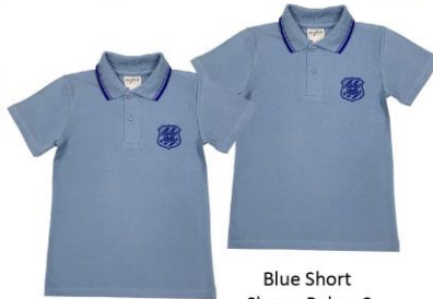
Blue Short Sleeve Polo x 2