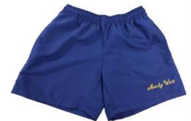
Microfibre Sports Shorts