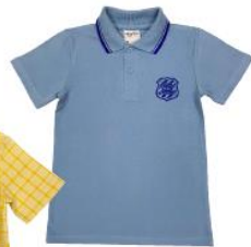
Blue Short Sleeve Polo