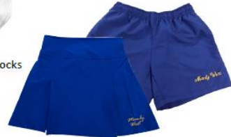
Microfibre Sports Skorts or Shorts