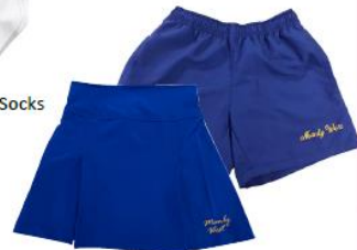
Microfibre Sports Skorts or Shorts