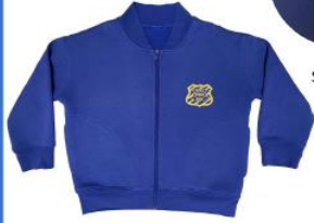
Cardigan/ Zip Jacket

Girls Kindergarten Starter Pack Suggestion Option A