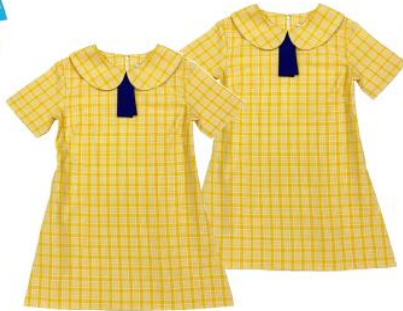
Yellow Checker Dress x 2