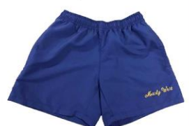
Microfibre Sports Shorts