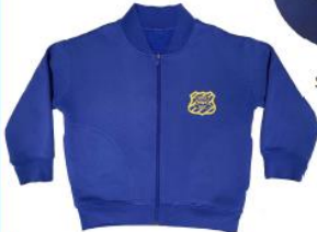
Cardigan/ Zip Jacket

Girls Kindergarten Starter Pack Suggestion Option B