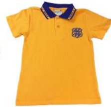
Gold Short Sleeve Sports Polo