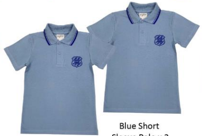
Blue Short Sleeve Polo x 2