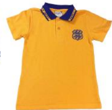
Gold Short Sleeve Sports Polo