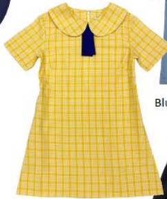
Yellow Checker Dress